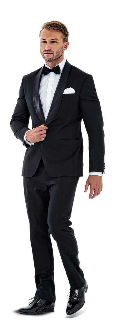
After the wedding, hit the casino with this Bond style one-button black tux with black satin trims, besom pockets & a curved shawl lapel.