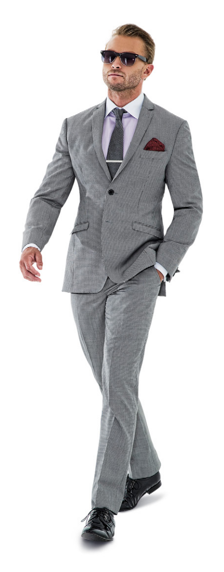
This black & white houndstooth suit is another unique look for the races – definitely a standout from block colours.