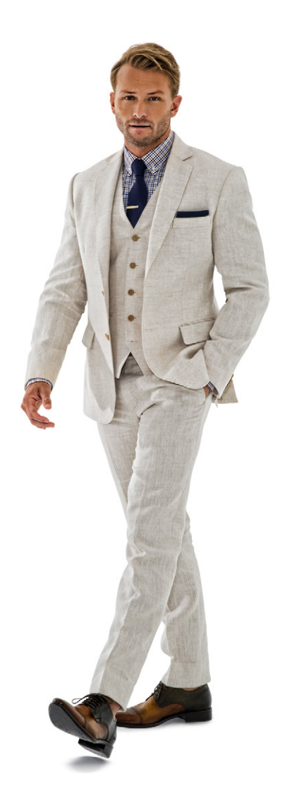
For slightly more casual affairs, a 3-piece linen sand coloured suit is perfect – especially for outdoor weddings.