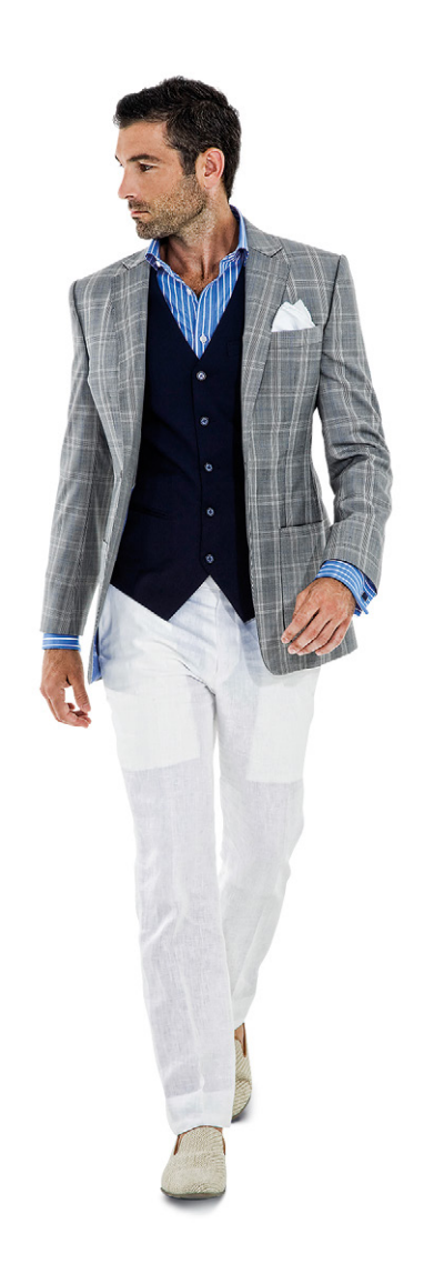
Try another variation by wearing the jacket with a navy waistcoat & white trousers.