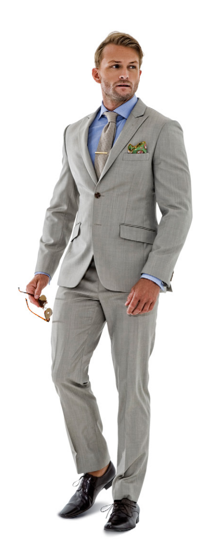
The beige-grey suit is another crowd dazzler, & perfect for race day.