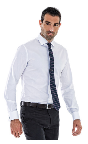
Everyone needs a crisp white shirt – it's the perfect blank canvas. Colour: White Pattern: Solid