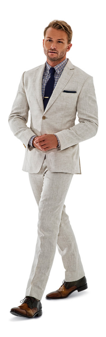
The 2-piece sand coloured linen suit is a great look for the races, again something different to the stock standard.