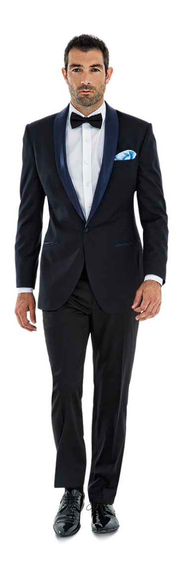
A midnight navy variant of the onebutton shawl lapel tux with navy satin trims, for when you're feeling blue, but in a good way.