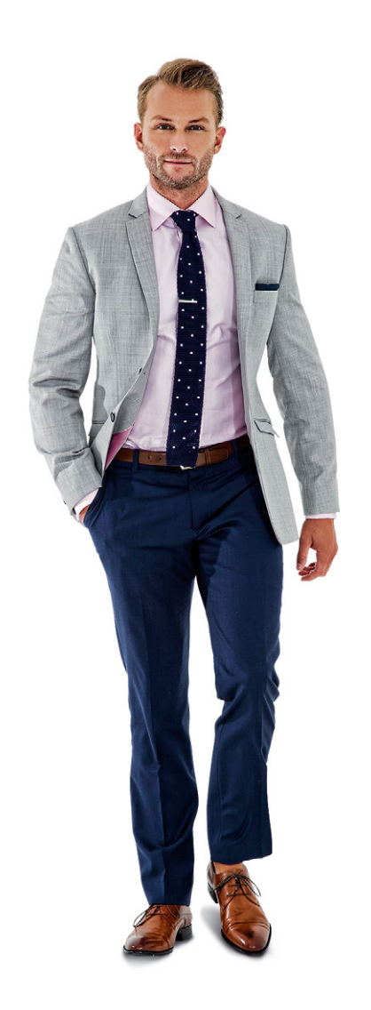
Light-grey & navy always go well together, so try mixing & matching.