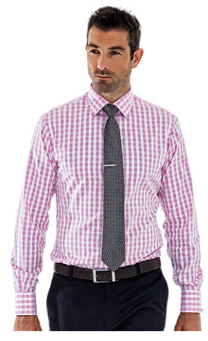
The business shirt with a casual spin, for a laid back look. Colour: Pink & white Pattern: Gingham check Collar: Spread Cuffs: French