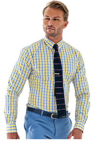
Can also be worn without a tie & sleeves rolled up on summer days. Colour: Sky, Yellow Pattern: Multi-Check Collar: Button-down Cuffs: Adjustable 2-Button