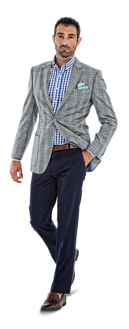
Nothing says smart casual like a nice chequered sports jacket paired with solid colour trousers (navy, beige, or cream will do).