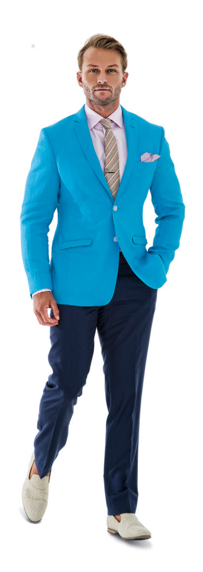
This light blue linen jacket will brighten up the day – pair with darker or lighter pants for another contrast look.