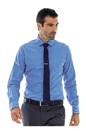
Great to wear under a solid suit & a solid or subtle pattern tie. Colour: Blue & white Pattern: Stripe Collar: Cutaway Cuffs: French