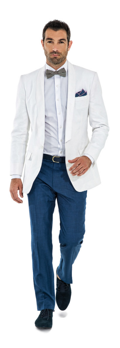
Pair blue sharkskin pants with a white jacket to create another unique look that is sure to stand out.