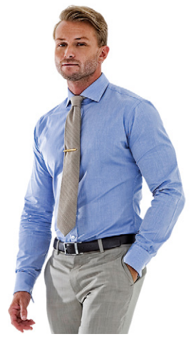
Blue herringbone – another classic business staple.

Colour: Blue Pattern: Narrow Herringbone Collar: Cutaway Cuffs: French