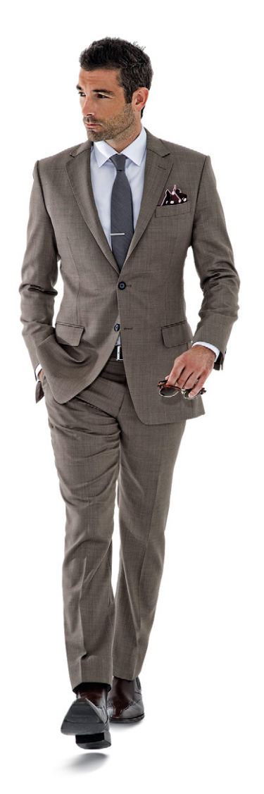
Be different with a khaki birds-eye pattern suit for the races, the khaki colour hints at a laid back casual attitude.