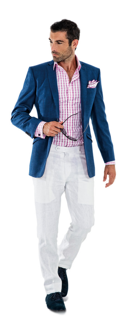
Wear just the jacket on different coloured pants to create an even more casual look.