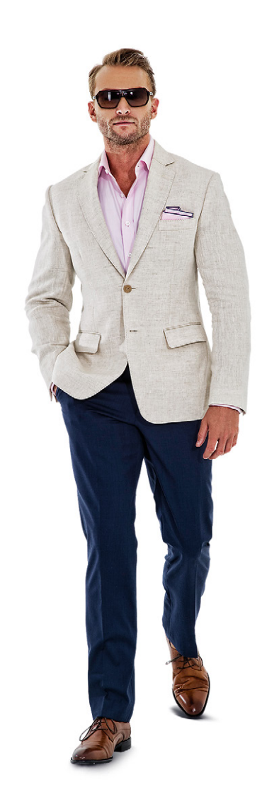
Wear the jacket as a separate on darker trousers for other smart casual events.