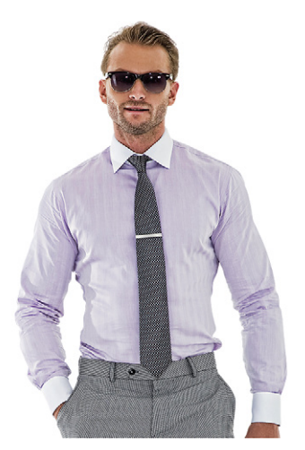
A spin on pinstriped banker shirts. Colour: Mauve, contrast white collar & cuffs Pattern: Herringbone Collar: Spread Cuffs: Adjustable 2-Button