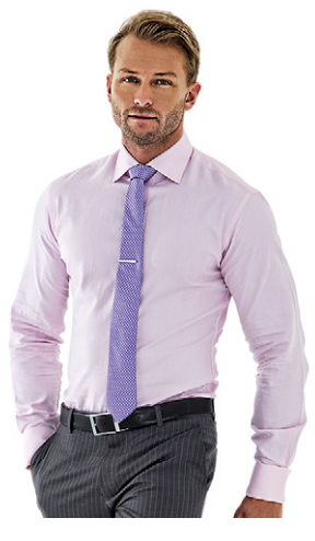
Pink is most women's favourite colour, that's why Women love Men in pink. Colour: Pink Pattern: Herringbone Collar: Spread Cuffs: French