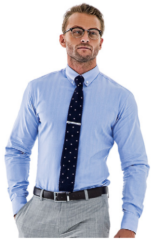
The informal button-down collar can be applied to a business shirt. Colour: Sky Pattern: Herringbone Collar: Button-down Cuffs: Adjustable 2-Button