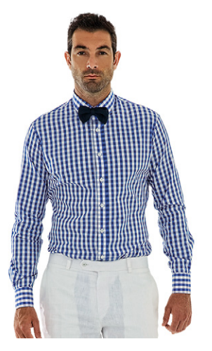
Can double up as a business shirt or smart casual. Colour: Navy Pattern: Gingham

Collar: Navy Pattern: Gingham Collar: Button-down Cuffs: Adjustable 2-Button