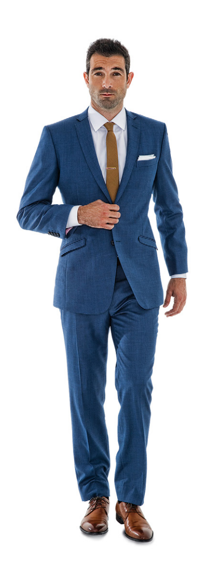
This 2-piece electric blue sharkskin suit has a subtle gloss, & will definitely catch attention – especially when paired with tan shoes & belt.