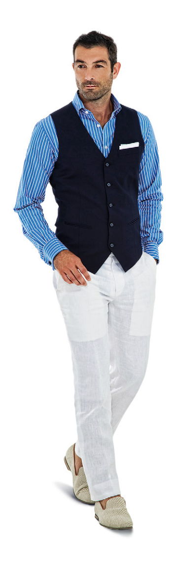
For days when it's just that little bit warmer, leave the jacket at home & keep the waistcoat.