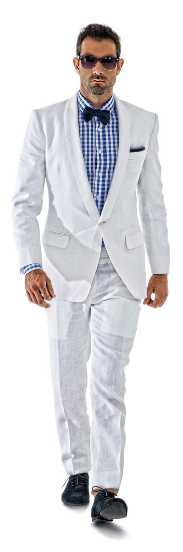
To really make a statement, try this white linen one-button suit with a shawl lapel. Great for a destination wedding in the Greek Islands, for example.