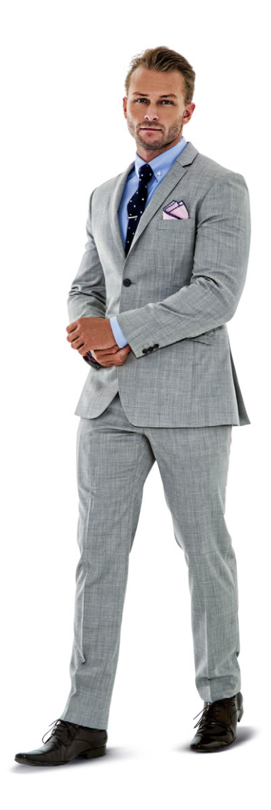
The light-grey fabric with slight crosshatch paired with a sky-blue shirt & navy tie has an immediate impact.